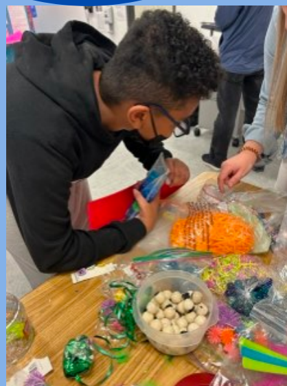
Students at Marquardt Middle School create fidget bags during OT group.