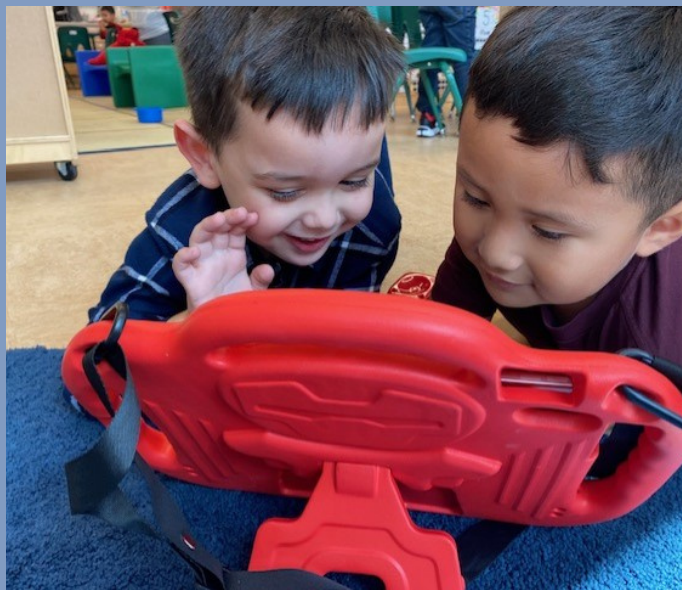
Two Marquardt District 15 preschool students communicate. One uses AAC.