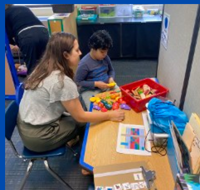
D93 SA classroom student works hard with his social worker.