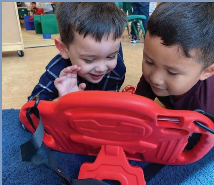
Two Marquardt District 15 preschool students communicate. One uses AAC.