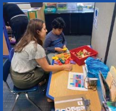
D93 SA classroom student works hard with his social worker.