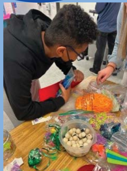
Students at Marquardt Middle School create fidget bags during OT group.