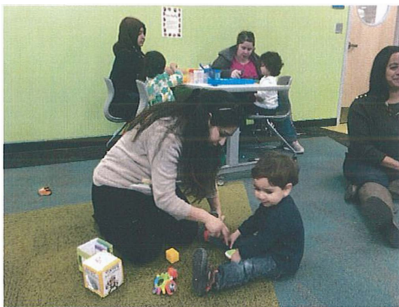
--Each parent knows best how to engage her child--

This month we held a four parent-child interaction groups, one at the Glen Ellyn Public Library, one at Glenside Public Library, and two at the Faith Lutheran Church location. In addition, we also assisted GPAT families who wanted to attend the GPS early childhood event, coordinated by the GECC/GPS partnership at Marquardt Administrative building.