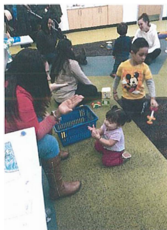
--Peek-a-boo in action--